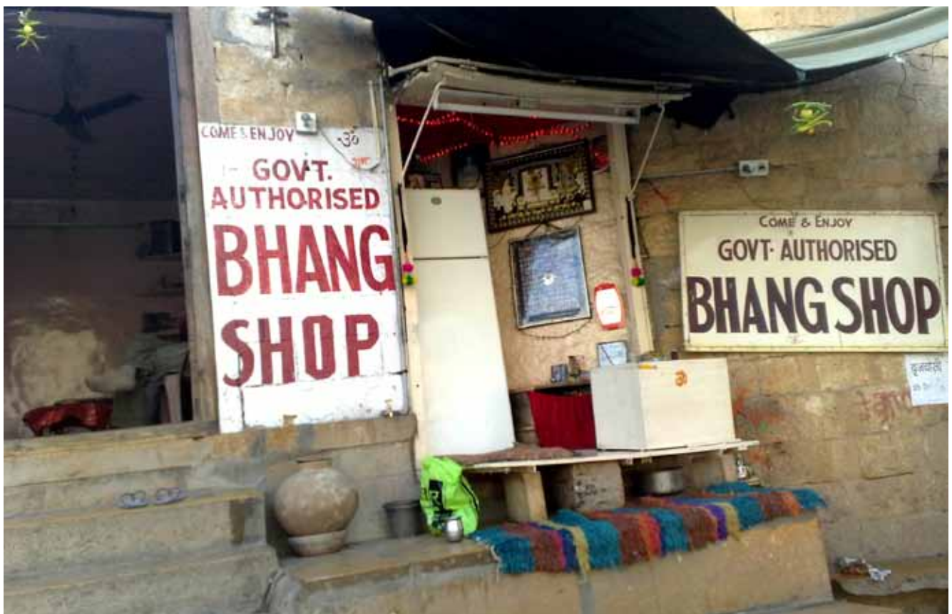
Bhang shop in Jaisalmer, Rajasthan, India.

Probably the best-known example of the latter category is Portugal, which decriminalized drug use, acquisition and possession for personal consumption of all drugs in 2001, for quantities not exceeding what an average user would consume in ten days. Portuguese officials were careful to ensure that the new policy remained within the “mainstream of international drug policy” and that decriminalization was consistent with the relevant provisions of the 1988 Convention. It was the Portuguese view that replacing criminalization with administrative regulations maintained the international obligation to prohibit those activities and behaviours. 21 Drug use, acquisition and possession for personal consumption are no longer considered a crime, although administrative