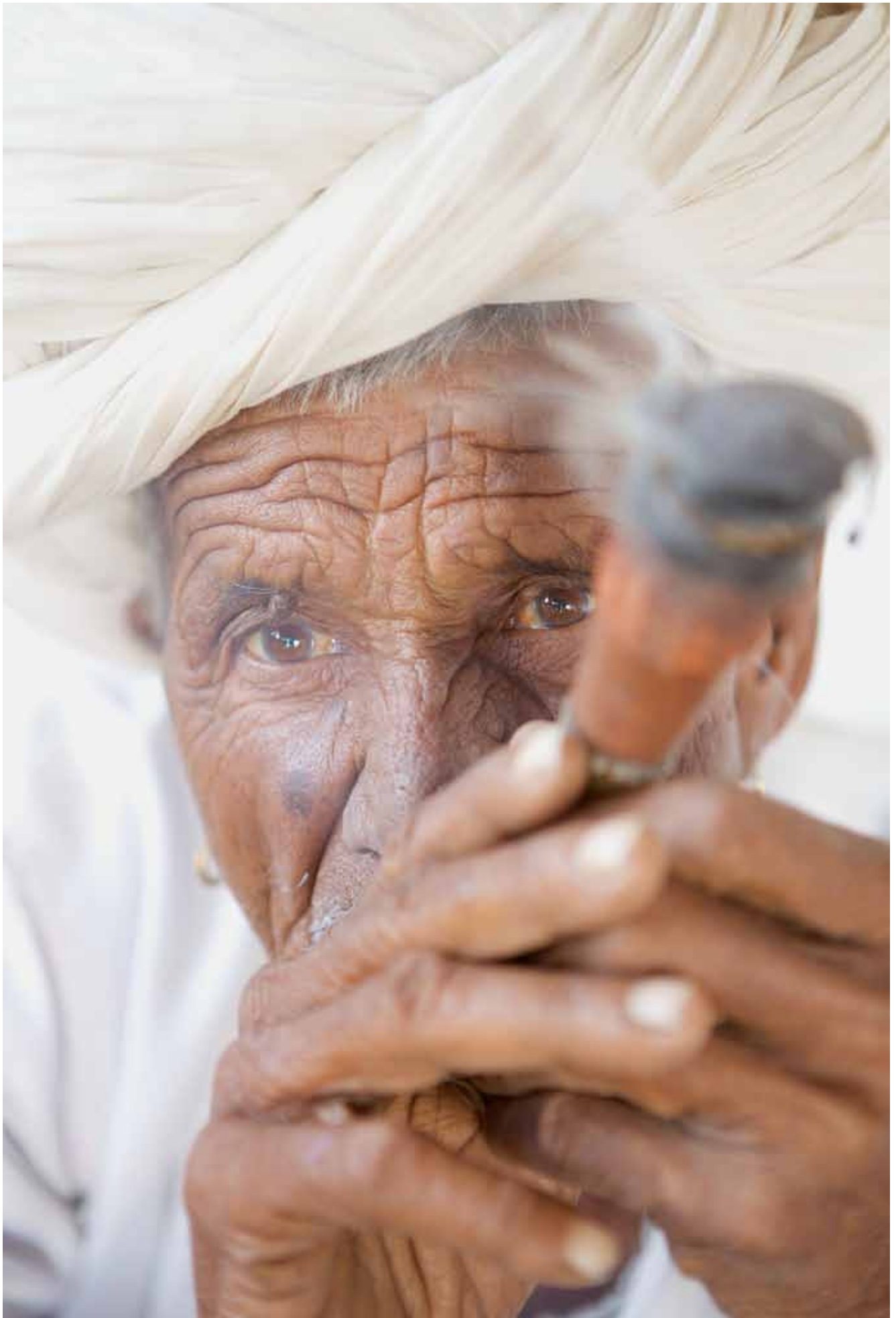
Bisnoi men smoking a pipe.