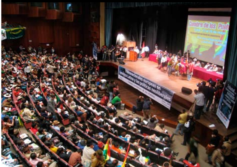
Hundreds of organisations from Latin America, the Caribbean and Europe presented in Lima their alternatives to the neo-liberal model, consolidating the basis for a new internationalism.

The Summit of the Peoples 'Enlazando Alternativas/Linking Alternatives 3' was celebrated in Lima (Peru) between the 13th and 16th of May, 2008, coinciding with the Summit of the Heads of State of the European Union (EU), Latin America and the Caribbean (LAC),