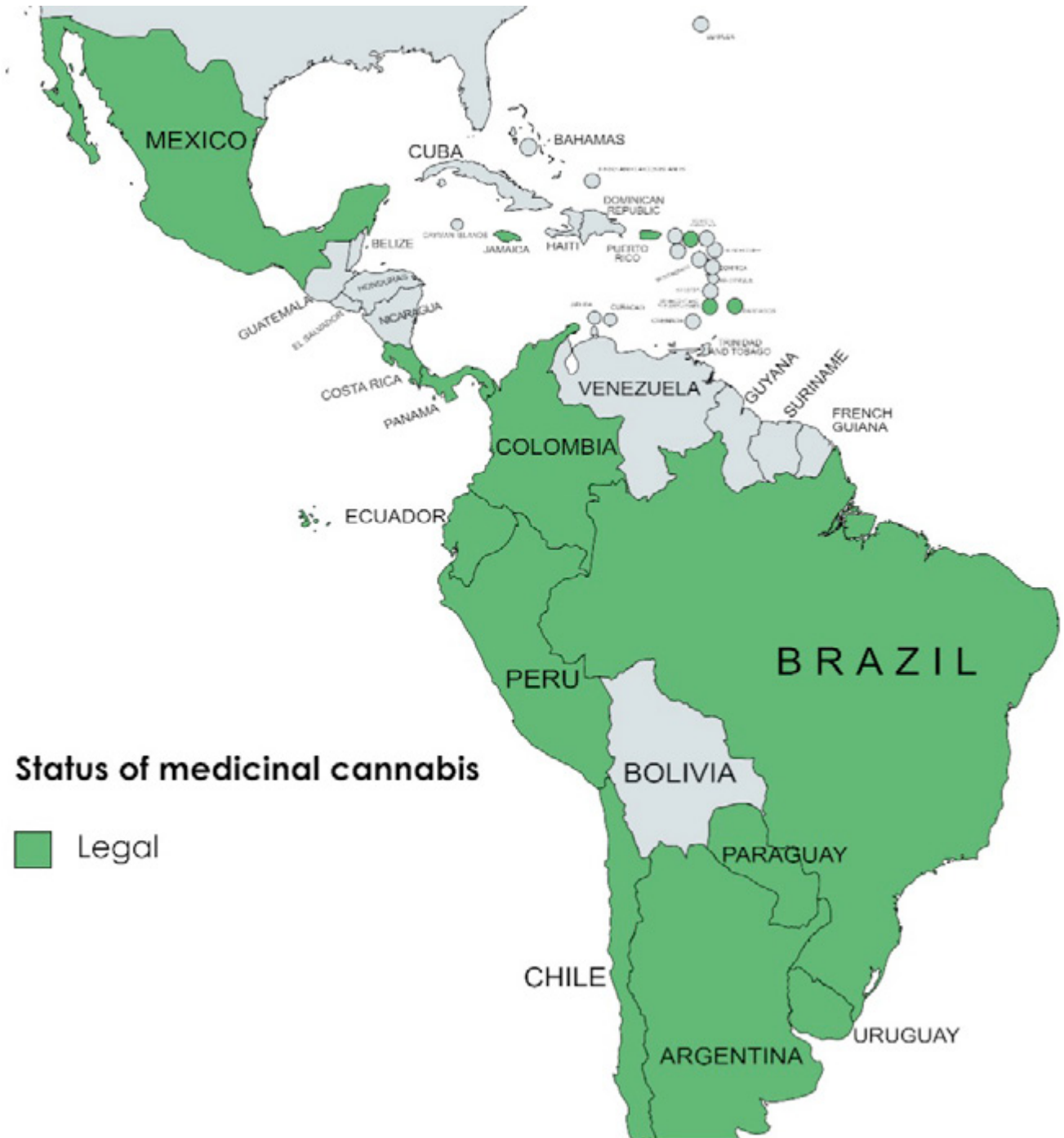
Map 1. Regulation of cannabis for medicinal purposes in Latin America and Caribbean, August 2022

It is worth noting that in any of these contexts, and even in countries where there is no regulation, individuals and groups make different demands for access to cannabis for medicinal purposes via the courts. They may aim to obtain authorisation to import products, cultivate cannabis, make cannabis-based medicines available free of charge, etc. Sometimes these demands, even if very restricted and ad hoc, are met, resulting in some form of access to cannabis for medicinal purposes through litigation before judicial bodies. 13 Box 1 shows the experience of this type of judicial activism by a Brazilian non-governmental organisation (NGO), Rede Reforma (Reform Network).