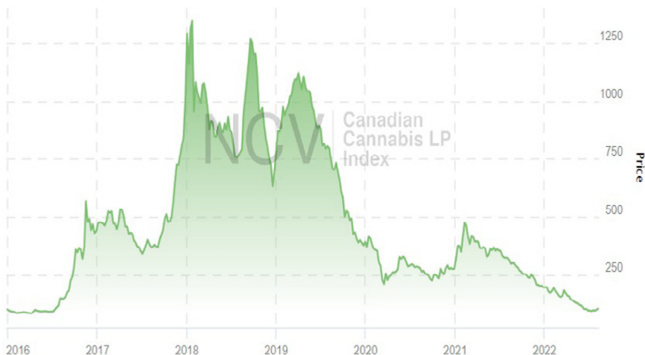
Figure 2: Canadian company stock price fluctuation (2016–2022) 23