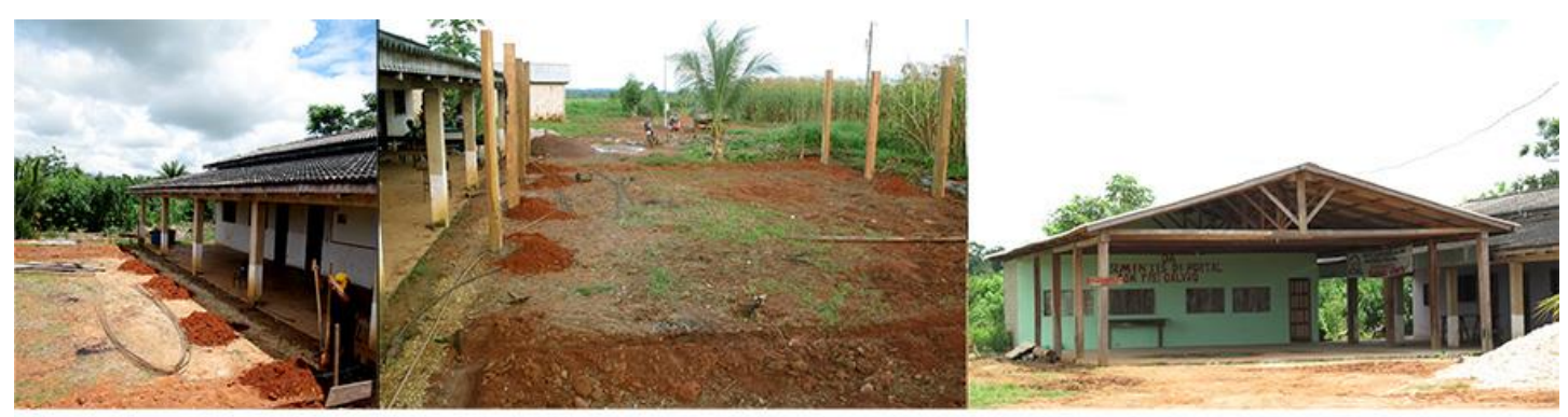
Figure 6. The building of a community center in what had been the main house of a ranching state. Left and Center: the 2011 construction project. Right: the new common area in operation in 2012.

Agricultores not only work on their family farms tending ecologically diverse sites. They also contribute to larger groups whose collective undertakings gravitate toward communal spaces like the one in Frei Galvão that the three of us helped improve in 2011. During that year, smallholders raised new pillars in and added a new floor to a house that just a few years earlier had been the command center from which a rancher had directed attacks against Frei Galvão's peasants. In 2009 the house had been transformed into a community space and by 2010 it housed one of seven community seed banks established by the Seeds of the Portal project (today the project has eight seed banks and a large regional seed bank is in the planning) [FIGURE 6]. While housing a seed bank the building linked 28 families in Nova Guarita with 132 families in all six municipalities that at the time were taking part in the Seeds of the Portal initiative.