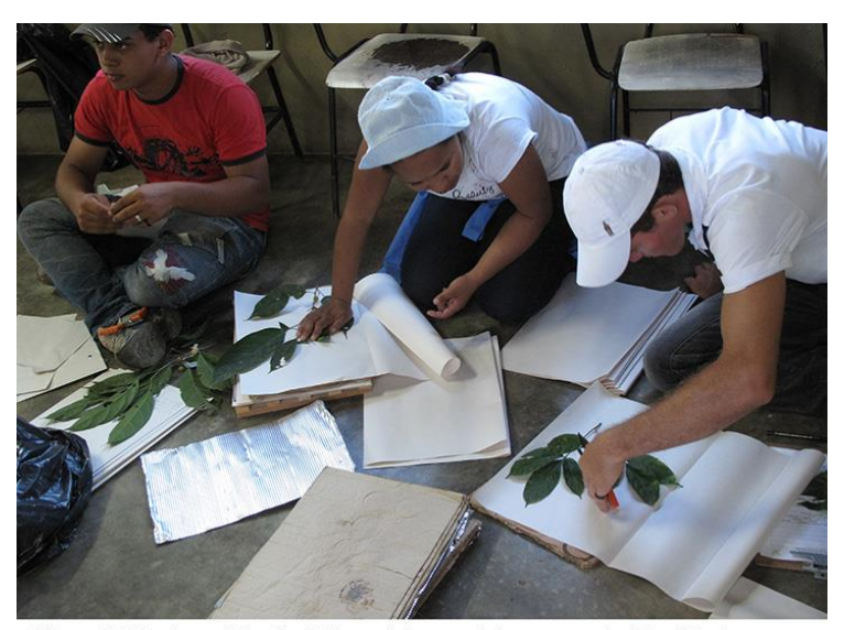
Figure 9. Members of the Seed Network in a workshop on species identification.

The Seed Network created as part of the Seeds of the Portal initiative currently moves more than 13 metric tons of seeds each year and has provided materials to more than 150 agro-ecological sites that have been established over the past seven years. These agro-ecological sites extend over more than 2,500 hectares and each has become an experiment that is generating knowledge on interactions among and between species, germination rates, and the impact of agro-ecological configurations on soils and waterways. Several IOV technicians who support smallholders in establishing these sites (themselves the sons and daughters of smallholder peasants) have earned undergraduate degrees in biology and forest engineering while working for the Institute. To support these efforts the IOV has established an Agro-Forestry Research Center [Figure] and research programs in agro-forestry with universities in Brazil and abroad, and is currently involved in the development of a Master in Agro-Ecology with the Federal University of Mato Grosso.