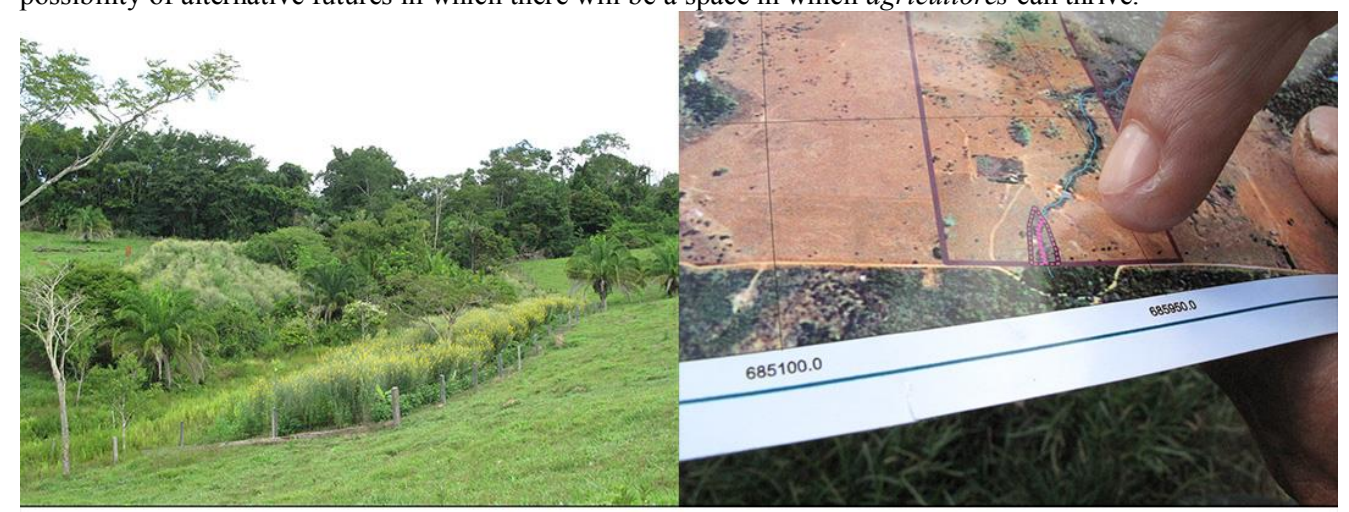
Figure 10. Left: Agro-ecological site in a peasant site. Right: The smallholder who tends the site shows to one of us (David) an image of the site with the agro-ecological site outlined in pink.

The outcomes of these efforts remain limited. The 150 agro-ecological sites supported by the project cover only a small portion of the sites involved. These sites, furthermore, represent but a fraction of the land in the Portal of Amazonia. Most smallholders taking part in the Seeds of the Portal project are, in addition, yet to derive substantial income from their ecologically diverse plots. What they have achieved, however, is still a fundamentally "political operation": a space where smallholders who have long been put asunder by the forces driving the expansion of monocultures are considering the possibility of alternative futures in which there will be a space in which agricultores can thrive.