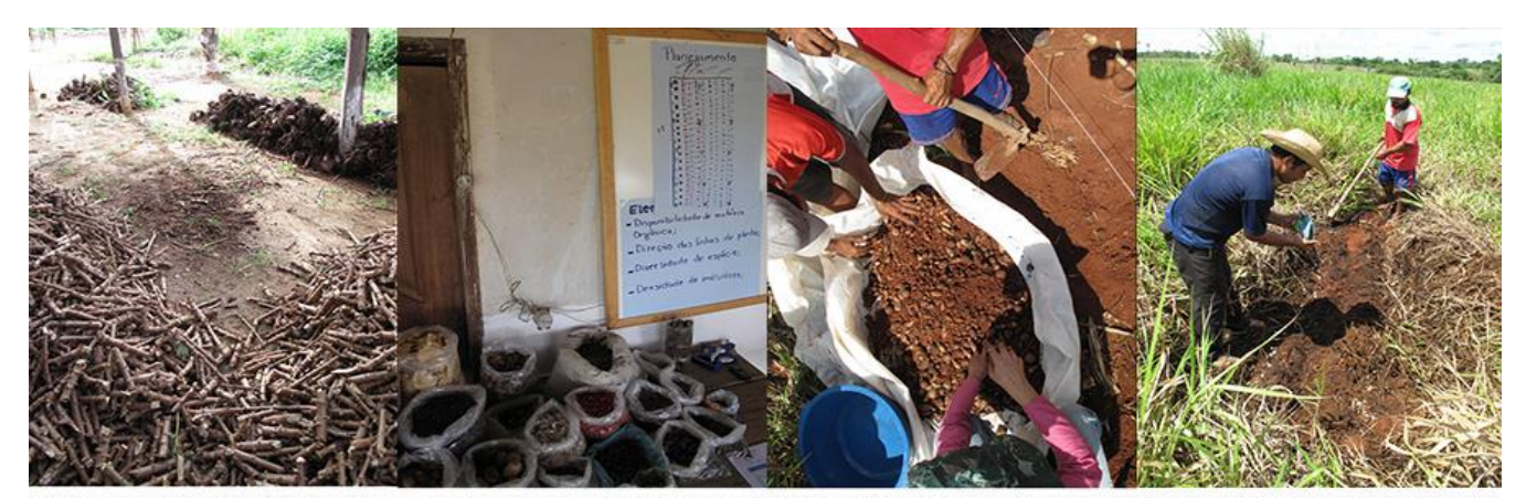
Figure 5. Preparations for (and demonstration of) the movuca method in Frei Galvao. Left mannioc and plantain stalks to be used in future agro-ecological sites. Center-Left native seeds to be used (in the background a diagram of an agro-ecological project). Center-Right: IOV technicians and smallholders mixing a variety of native seeds with soil as they demonstrate the movuca method. Right, Seed-soil mixing being applied in a previously deforested area.

The most visible outcomes of the Seeds of the Portal project are agro-ecological plots established at peasant sites using a method known as the movuca . Whereas agro-industrial architecture seeks to bring plant metabolism and life cycles of a wide range of organisms into an human (industrial) periodicity, the movuca intends to bring agriculture closer to the protracted time of succession processes. Following this approach, a blend of seeds that includes native plants with short lifespans, fruit trees, and large native trees that may live for centuries is mixed with soil and applied to a given area [Figure 5]. The movuca thus creates a process of species succession whereby plant species with short lifespans grow and then die, generating in the process fresh biomass that helps enrich soils and thus creates conditions under which other species with longer timespans may flourish.