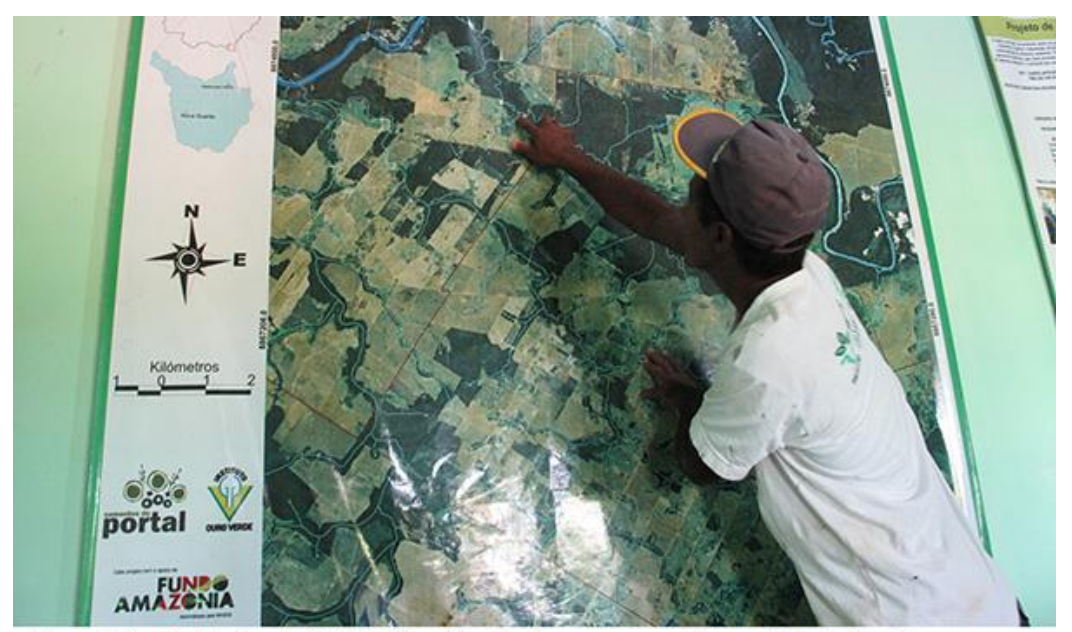
Figure 4: Smallholder showing the Frei Galvao's location in an area were native vegetation had long been transformed into pastures

Declarations and performances, then, made smallholders into "a people" whose irruption in public life undermined dominant associations between the general interest and powerful landholders (Badiou 2016, Rancière 2016). Frei Galvão's residents knew, however, that economic and ecological pressures could wipe out their political achievements. Their new settlement was distant from markets, most of its surface had been deforested, much riparian vegetation had been destroyed, and as a result waterways were dwindling and soil fertility was withering [Figure 4]. If declarations and performances had changed their political situation in the eyes of others, they still needed to cultivate new ecological conditions in which could sustain their projects and keep their lands.