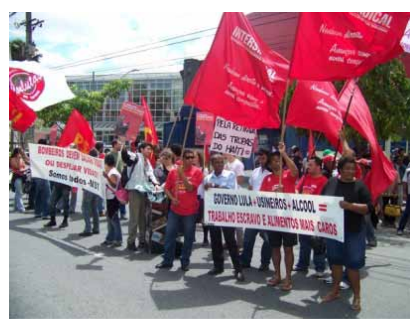
MST and other social movements protest outside the International Biofuels Conference, São Paulo, 20 November 2008. Slogans blame biofuel policy for slave labour and more expensive food.

Contrary to the above diagnoses and assumptions, sustainability problems have causes in political-economic drivers – e.g. for extending monocultures to more land, for subordinating land use to global markets, for gaining a competitive advantage in global value chains. If technically successful, more efficient methods per se would not counteract those drivers of harm in the global South. Indeed, greater efficiency arguably provides greater commercial incentives for extending agro-industrial systems to more land, especially to supply expanding global markets for fuel and feed. A 'smart-green' techno-fix provides a false solution. It is aimed at the wrong problems – e.g. how to sustain Europe's growing consumption of transport fuel, and how to maximise value-added from global commodities.