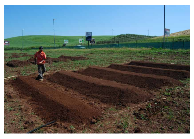
Synergic agriculture at the Orti Solidali, http://ortisolidali.wordpress.com

We devised appropriate indicators for the sustainability of such an initiative.