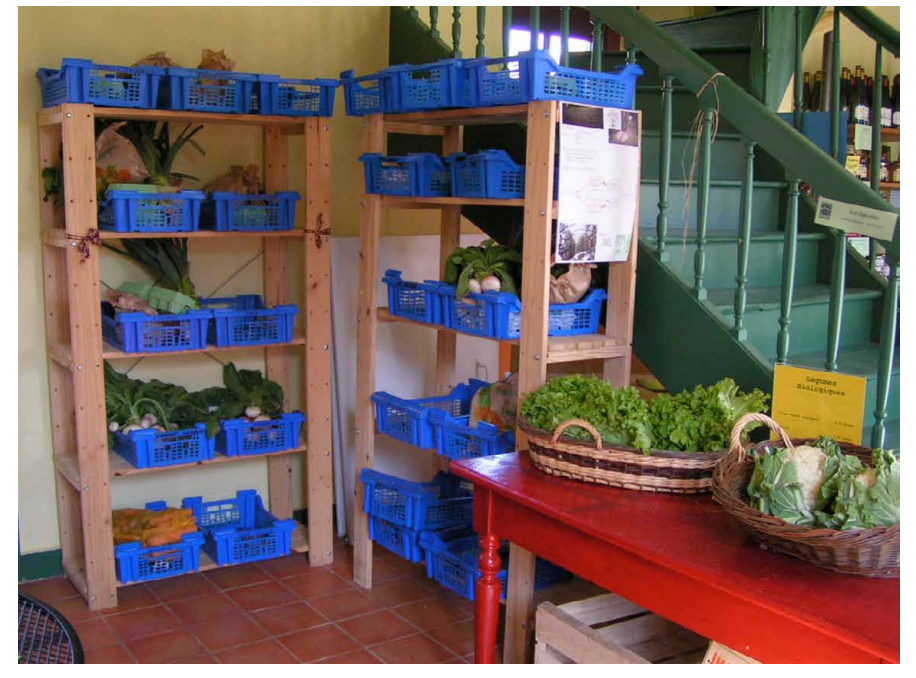
Box scheme (panier) in Brittany.

Indeed, our research has helped to persuade some local authorities to give such support through new policies. In the Brittany regional context, agro-food policy is still dominated by agro-industrial farming interests. Short food supply chains could not gain support through political lobbying, especially by criticising agro-industrial systems. As a different strategy, our research has highlighted environmental advantages of short food supply chains, especially in the wider policy context of climate change and food insecurity.