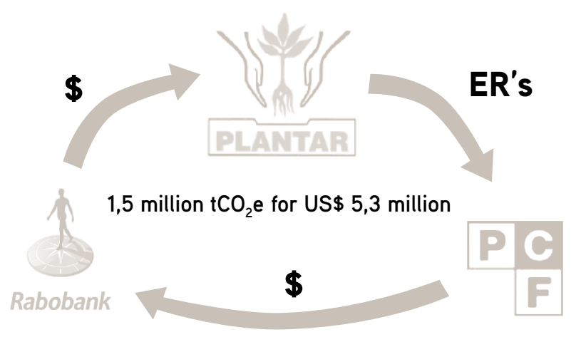
Figure 1. Financial structure of Plantar