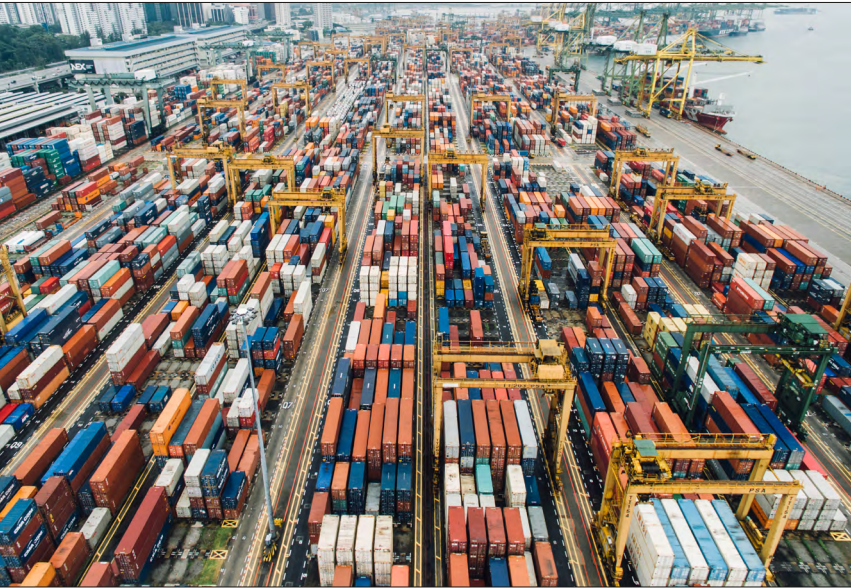
In 2016, sea transport accounted for over half of all goods imported into the EU.

be shared are specified and include “the objectives of, legal basis and rationale” for the measures (Art. 4.6.6). This mandatory requirement to share detailed information about the rule-making process itself stands in contrast to the allegedly voluntary basis of cooperation activities per CETA’s regulatory cooperation chapter (Art. 21.2.6).