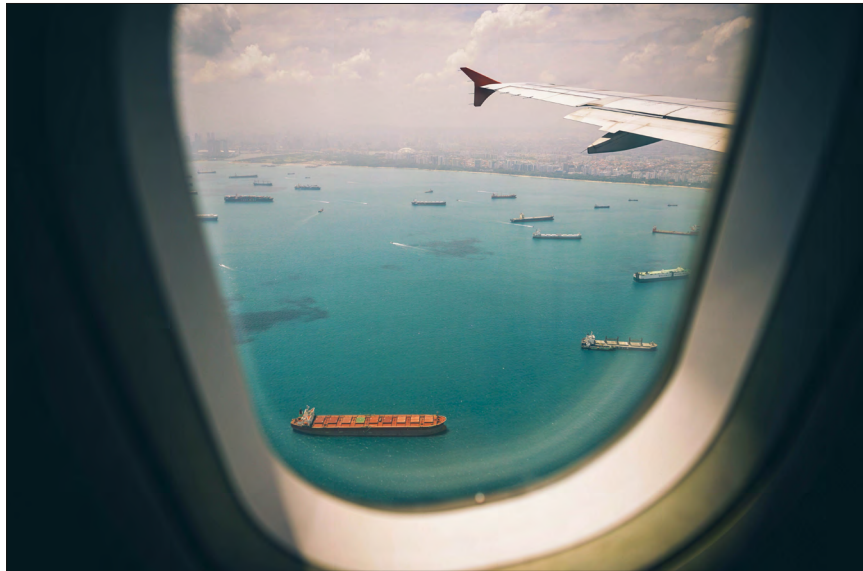
International trade is a major driver of the increase in sea and air freight transport

Many of these ideas were themselves based on an OECD checklist published in 1995, the year the WTO was established, which recommended ways that governments could keep on top of “intensified economic competition” from globalisation and new technologies in an era of shrinking government and budgetary restraints. 5 Governments, having cut the size of their public sectors (at the urging of the OECD, World Bank and International Monetary Fund, we should add), 6 “must learn to do more with less” , said the OECD. This might include “upgrading the legal and factual basis for regulations, clarifying options, assisting officials in reaching better decisions, establishing more orderly and predictable decision processes, identifying existing regulations that are outdated or unnecessary, and making government actions more transparent” . 7