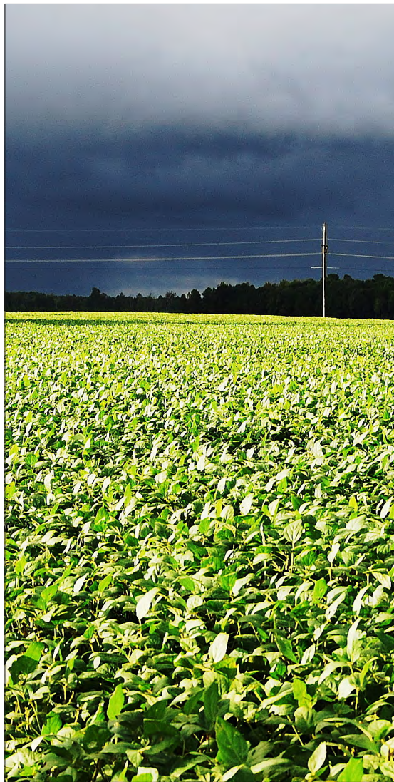
The Committee on Agriculture first met in September 2018.

The EU is a net importer of wood products, but prohibitions on the use of some biocides for pest control have been a long-standing irritant of the Canadian forestry and wood sectors. At the May 23, 2018 meeting of the