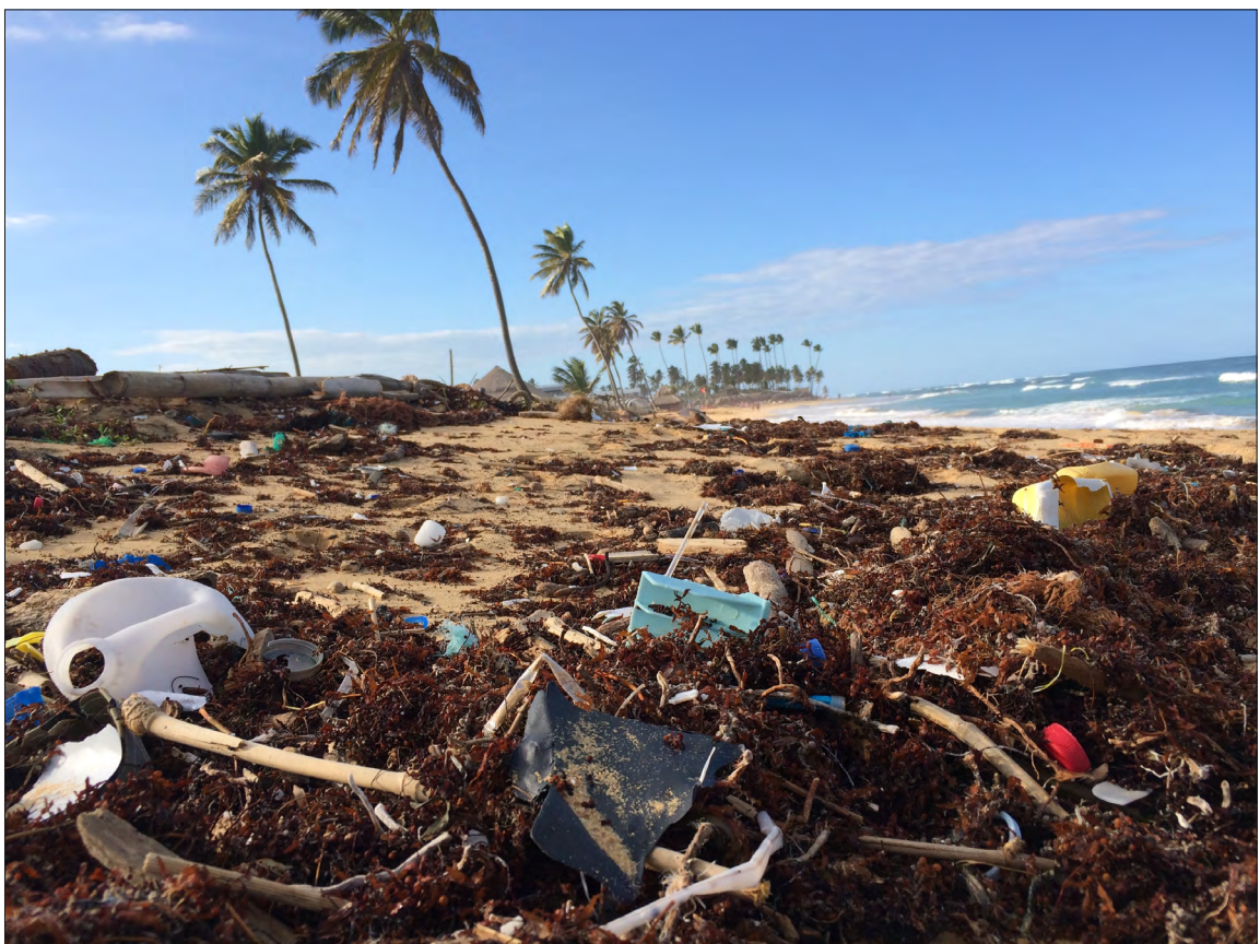
Plastic products increasingly pollute seas and beaches