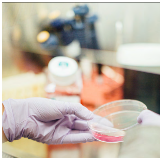
Chemicals used in some sun protection products might be harmful to human health and the environment

From a precautionary perspective, this seems like the wrong moment for Canada to be giving up the opportunity to test an entire