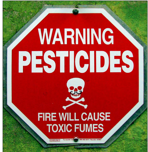
Canadian industry proposals for areas of future regulatory cooperation include the regulation of pesticides.

With respect to cosmetics, stakeholders were informed of the North American RCC pilot project (discussed above) in which products tested in the U.S. will be accepted into Canada as safe without the need to inspect them at the border. It was proposed that Canada could open the EU to the same arrangement. According to the agenda of the first RCF meeting, "Some 'cosmetic-like' products regulated