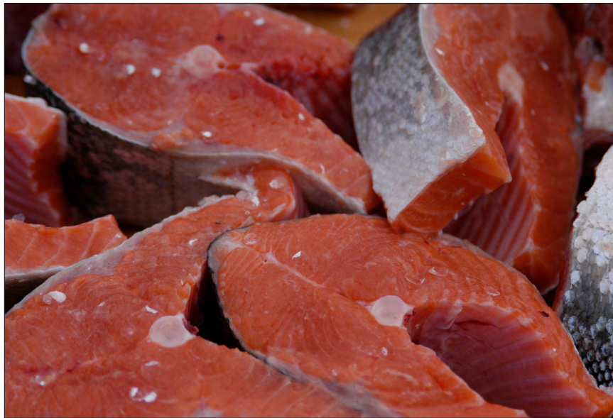
Genetically modified salmon is legally sold within the Canadian Market

At a meeting in Ottawa in September 2018, organised by Environment and Climate Change Canada to assess civil society interest in participating in the CETA domestic advisory