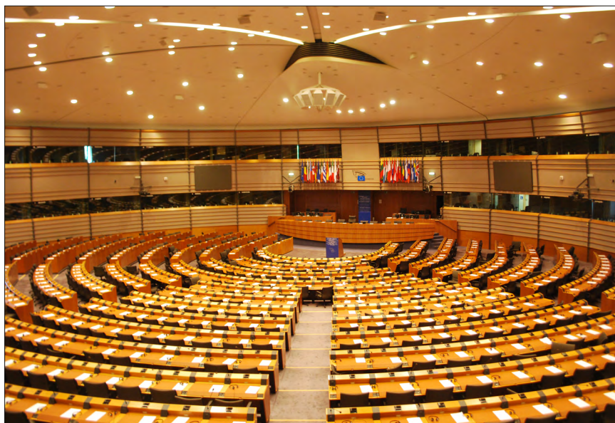
The European Parliament in Brussels

Governments should also provide funding to NGOs to participate at the Codex and other international standards setting bodies to make it more likely their views will be integrated into international best practices. At the same time, we should dispense with the idea that regulatory divergence is only acceptable where regional conditions (usually physical, geographical, meteorological, etc., but also sometimes social) make it necessary