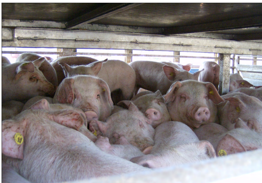
Conditions of animal transport are amongst the first five working projects of the EU-Canada Regulatory Cooperation Forum (RCF)

CETA also aims to “build trust” between Canada and the EU about their regulatory regimes in general (Art. 21.3[b]) with an aim to: “improve the planning and development of