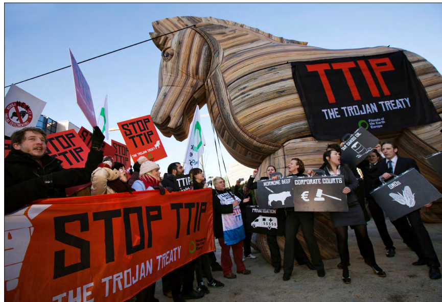
Protests against TTIP in Belgium

European public interest watchdogs such as the Friends of the Earth Europe, Corporate Europe Observatory (CEO) and Lobby-Control, among many others, have warned about similar sleights of hand within the European Commission. A 2006 briefing note from CEO linked the Commission's "Better Regulation" agenda to U.S.-style deregulation as well as trade deals like the dormant Transatlantic Trade and Investment Partnership (TTIP), which aim to replace the precautionary principle with regulatory impact assessments, cost-benefit analysis, "red tape reduction" and risk management. 23 Like in Canada, the Commission's "Better Regulation" process was developed by an industry-heavy 15-member working group with links to the GMO-farming and agribusiness lobby, tech giant Invensys, the coffeemaker Illy and a Polish business association linked to BUSINESSEUROPE. Included in the package is an annual review of EU law in search of rules that can be weakened or eliminated, and a "fitness check" for some laws to identify "excessive burdens, overlaps, gaps, inconsistencies and/or obsolete matters". 24