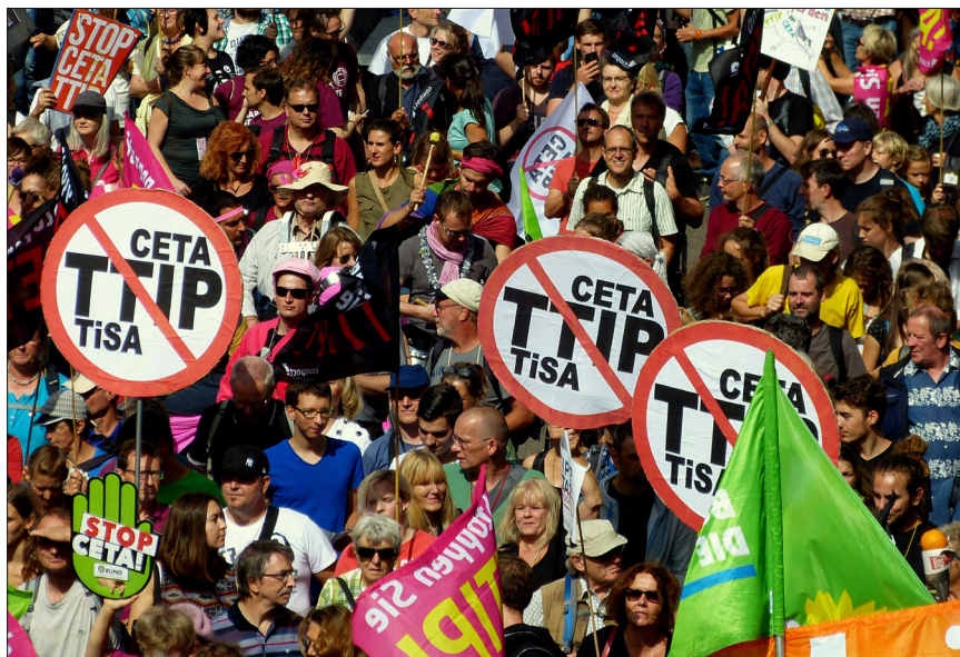
Protest against Free Trade Agreements in Germany

“Good regulatory practices” (GRP) are therefore, at once, an ideology of how and when government should intervene in the market (to protect people or nature, for example), a set of institutional arrangements for regulating in a pro-business way and in cooperation