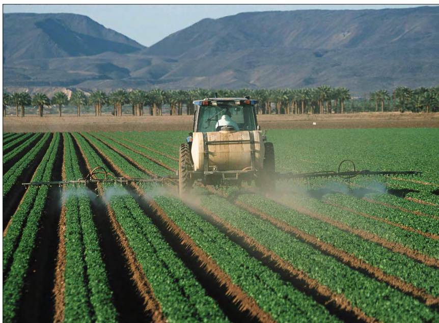
Pesticides used in industrial agriculture can have negative impacts on human health and the environment

Until the early 1990s, Canada showed potential to be a leader on environmental protection. In the free trade era, federal regulatory policy shifted to prioritise innovation (as discussed above) and tended to favour the adoption of U.S. norms wherever possible. The pesticides working group under NAFTA all but locked Canada and the U.S. into a common way of assessing risks, registering new chemicals and uses, and setting maximum residue levels for