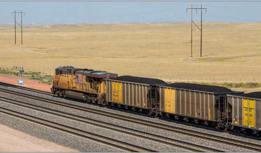
Regulatory Cooperation between the U.S. and Canada on rail transport has not yet prioritised safety

However, there are also examples of past cooperation that has produced sub-optimal results from a public good perspective—where alignment got in the way of adopting the highest standards, or a mutual recognition agreement leaves consumers less protected than they were before—and where there is a strong likelihood in the future of Canada accepting lower standards for workplace safety. The future of regulatory cooperation was also given a decidedly deregulatory emphasis by the current U.S. administration, with strong support from federal regulators in Ottawa.