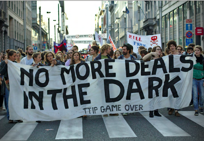
Protests against TTIP and CETA in Brussels

animal transport), cosmetics, pharmaceutical inspection (a follow-up to the mutual recognition agreements under the EU-Canada Trade Initiative), and the possibility of reconciling the Canadian and European consumer product safety reporting systems (EU RAPEX and RADAR). It was suggested that success on reconciling differences in these areas would give industry and NGO stakeholders confidence that the process works and encourage future collaboration on more difficult, long-standing regulatory differences.