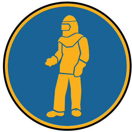
Hazardous chemicals caused nearly three million non-fatal private industry injuries or illnesses in 2012.

In their submission to OIRA proposing priorities for the RCC for the next few years, the United Auto Workers (UAW) noted several