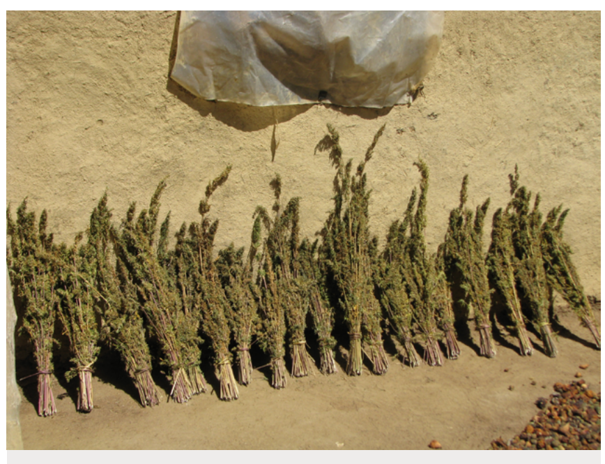
Cannabis drying in Morocco.

Moreover, what we can now see is that it is not the case that States will face significant condemnation from the international community for cannabis reforms that are increasingly common practice across the world. Opting for reform and acknowledging non-compliance can help set the stage for treaty reform options that can be implemented collectively among like-minded States, such as the inter se option.