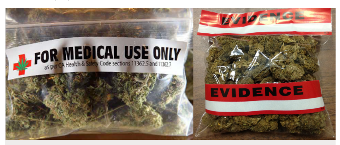
Above, cannabis as both a licit medical product and police evidence.