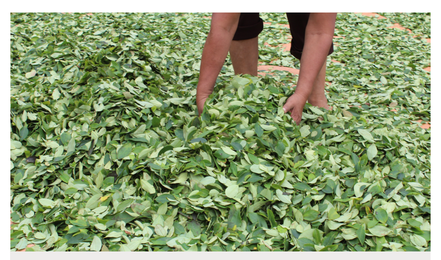
Coca is dried in Bolivia.

following the same treaty procedure, but there are differences to be taken into account. The main legal issue relates to article 19 of the VCLT. which requires that a reservation must not be "incompatible with the object and purpose of the treaty." Those overall aims of the Single Convention are expressed in the preamble's opening paragraph regarding concern about "the health and welfare of mankind" and the treaty's general obligation to limit controlled drugs "exclusively to medical and scientific purposes." Making a reservation exempting a particular substance from the treaty's general obligation to limit drugs exclusively to medical and scientific purposes is explicitly mentioned in the Commentary on the Single Convention as an option that could be procedurally allowable, for coca leaf as well as for cannabis.<sup>47</sup> While the absence of any accompanying cautionary text seems to imply that exemption by means of a reservation of a specific substance from the general obligations would not in itself constitute a conflict with the object and purpose of the treaty as a whole, this would certainly be an important legal discussion to be had in the context of crafting reservations. The same issues would arise with an inter se agreement (see above), which comes close to a form of "collective reservation."