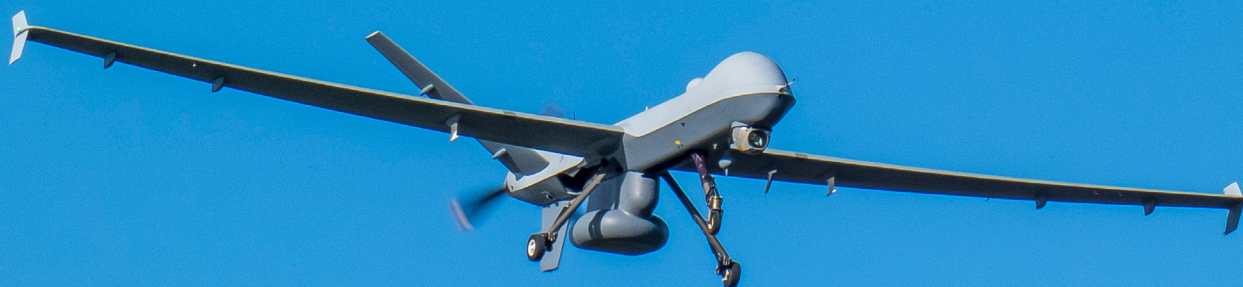
Predator B Drone landing at Mathis Field in San Angelo. Border Surveillance Drone operated by U.S. Customs Border Patrol

There is a long record of human rights violations in detention facilities, including those run by private prison and detention companies CoreCivic and Geo Group, 25 which maintain lucrative contracts with ICE to detain and surveil migrants. 26 People in ICE detention are subject to violence, sub-standard medical care, lack of basic necessities like edible food and hygiene products, denial of medical treatment, prolonged solitary confinement, and discriminatory practices. In December 2019, detainees sued Geo Group for coercive labor practices, including "violating minimum wage, unjust enrichment, and antislavery laws by coercing detainees to work for free, or, in some cases, $1 per day, by threatening them with punishment and depriving them of basic necessities." 27 Geo Group also runs two migrant detention centers in the UK.