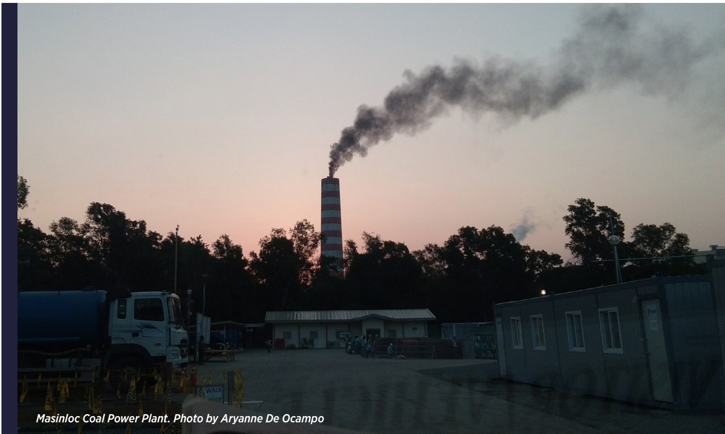
Masinloc Coal Power Plant.

This brief illustrates how BlackRock, Vanguard, and State Street are financing the climate crisis through investments in fossil fuel and agribusiness companies, which drives displacement, and then profit from racist and xenophobic responses to migration through investments in BSI companies. It discusses these asset managers’ failure to adopt effective human rights policies that would ensure their investments are not enabling human rights violations and are aligned with international frameworks, such as the UN Guiding Principles on Business and Human Rights, and the OECD Guidelines for Multinational Enterprises. It calls on governments, investors, and climate movements — particularly the Global North climate movement — to embrace an intersectional, rights-based approach rooted in principles of climate justice when engaging in efforts to transform financial institutions.