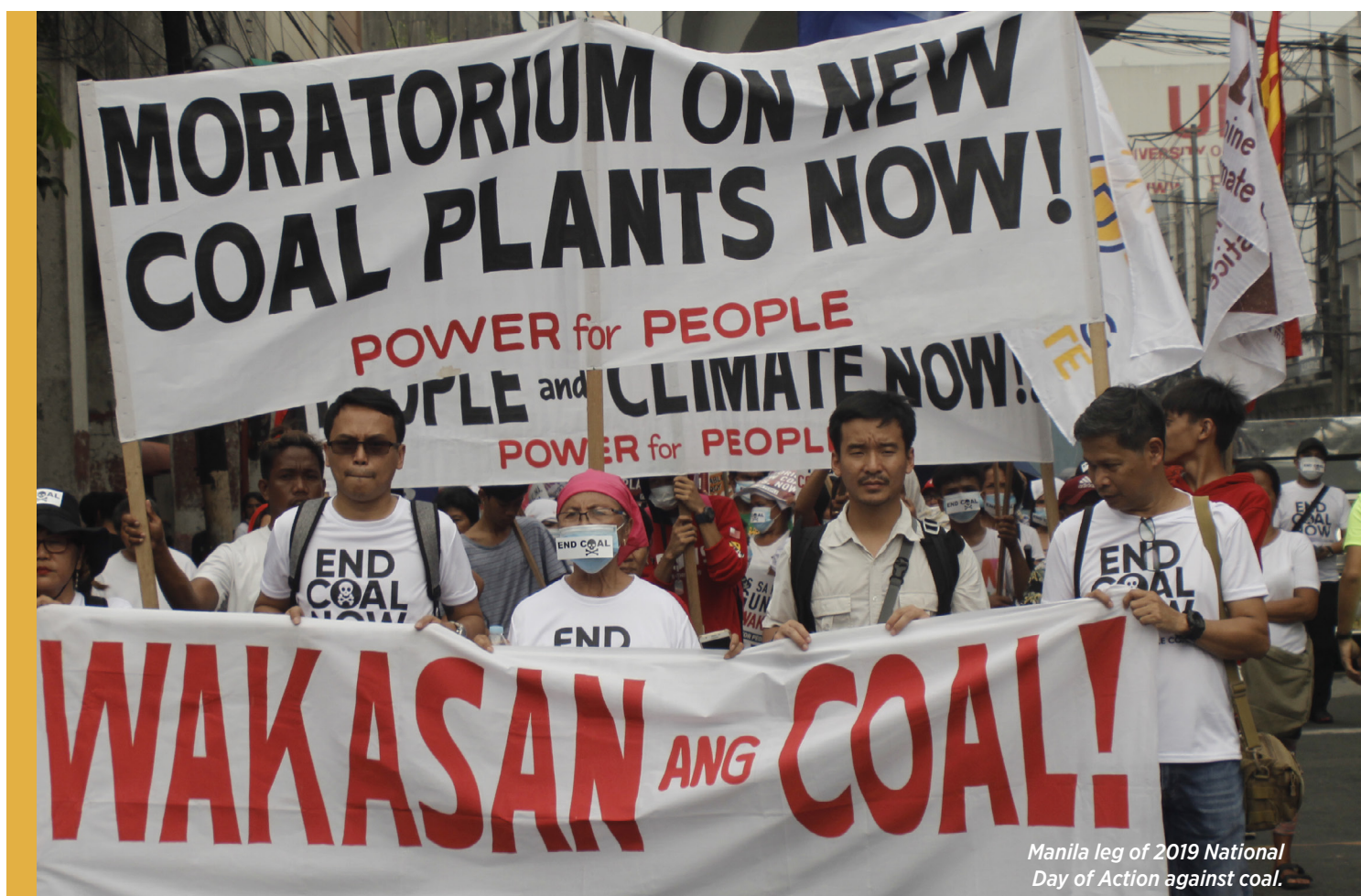
Manila leg of 2019 National Day of Action against coal.

By providing significant financial support to the industries responsible for the climate crisis and the border surveillance industry, institutional investors such as BlackRock, Vanguard, and State Street are enabling a status quo of climate inaction, criminalized migration, and increased militarization — all while presenting themselves as sustainable, climate conscious, net-zero asset managers. 45