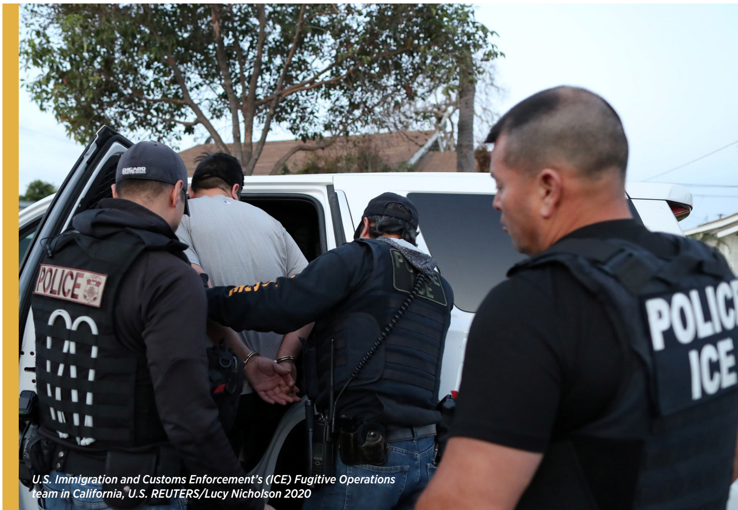
U.S. Immigration and Customs Enforcement's (ICE) Fugitive Operations team in California, U.S. REUTERS/Lucy Nicholson 2020

As more people migrate in search of safety, security, and dignity, governments are increasingly relying on the border and surveillance industry to control and curtail movement and maintain “border security”. This is in large part due to the influence of the border and surveillance industry alongside military interests to cast climate change as a national and international security issue, and migration as a threat.