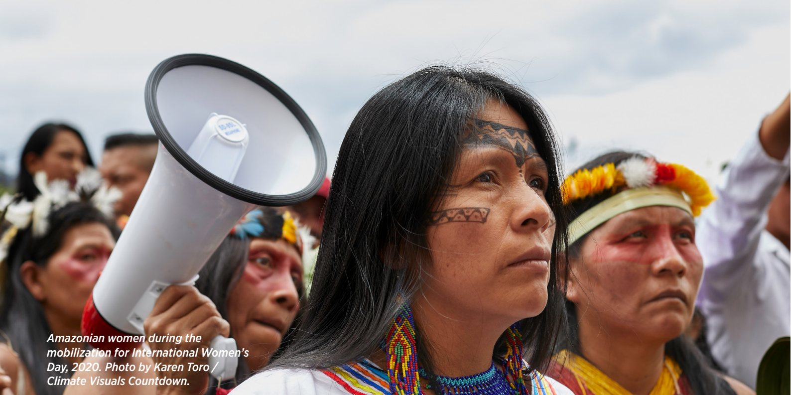
Amazonian women during the mobilization for International Women's Day, 2020.