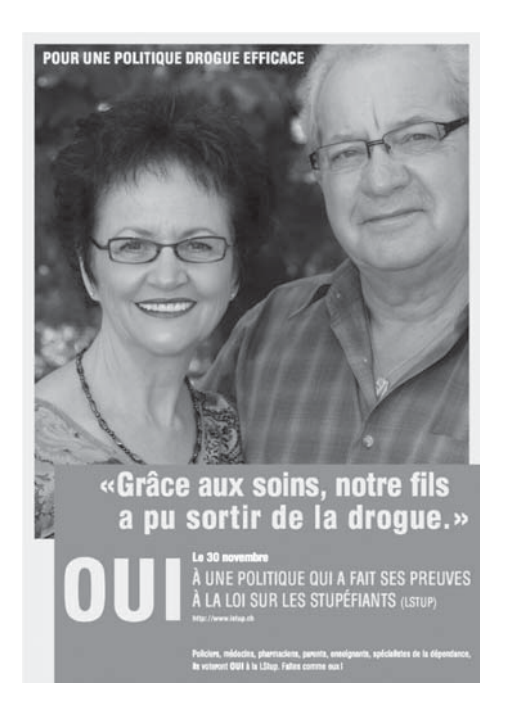
Figure 3: Posters used by the "yes" coalition for the four-pillars referendum, November 2008

The public statements, posters, and media work undertaken by this coalition was a lesson in itself for crafting messages that would resonate with a general, nonexpert public. Two posters that were widely disseminated are in Figure 3 below.