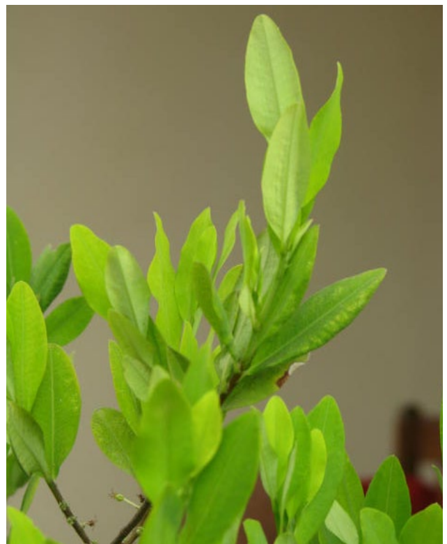
The coca plant

“Inside all indigenous houses there is something we call a Nazatul, which contains all the things necessary to survive. The coca leaf is part of that. It gives strength to the workers and