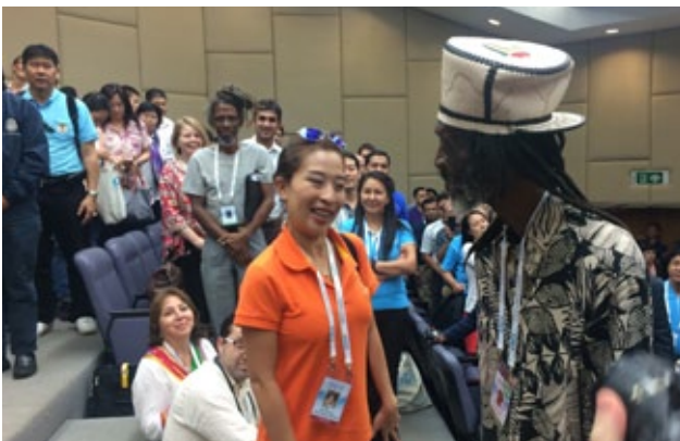
Steering Committee member Spirit speaking with Thai Royal Highness