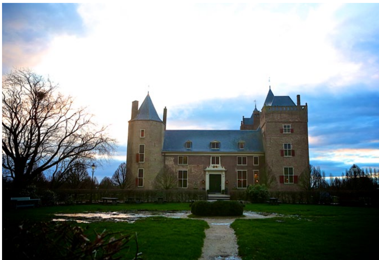
Slot Assumburg in Heemskerk

During the whole of day one, all four groups discussed each topic, resulting in several documents reflecting the debate and interventions.