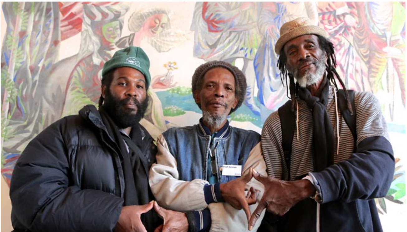
Three GFPPP participants from the Caribbean

few governments have defended the right to use these plants for traditional or ceremonial uses, and questioned the drug control regime for this reason.