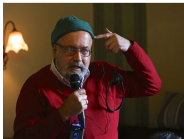
Delegate from Peru explains the situation regarding eradication in the coca producing valleys of his country

“The US government was responsible for eradications (marihuana), now it’s done by our national police (on foot). The current president prefers the US to not be involved. The farmers, who do not want to be subjected to the eradications, grow higher up in the mountains. The difference in eradications by police and US; the police (on foot) eradicate more. After eradications, farmers grow again.”