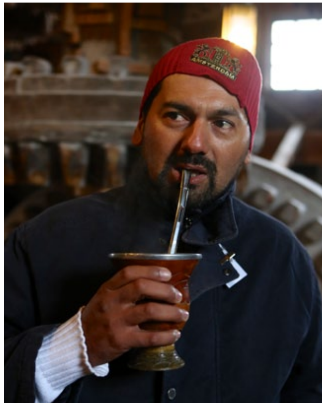
Delegate from Paraguay

Most of the GFPPP participants came from countries or regions where no AD projects