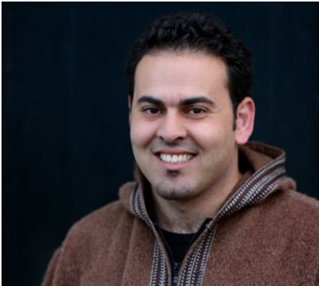
GFPPP participant from Morocco

therefore deprived of the opportunity to officially defend themselves.