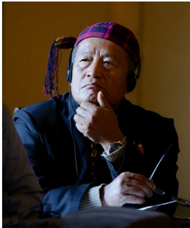
Delegate from Myanmar

“The government needs to think in big terms, it affects a huge amount of people throughout the entire country. We only receive names of projects, but nothing happens. So with the course of time, growers don’t believe in the government anymore. The trust is gone because of all the failed projects.”