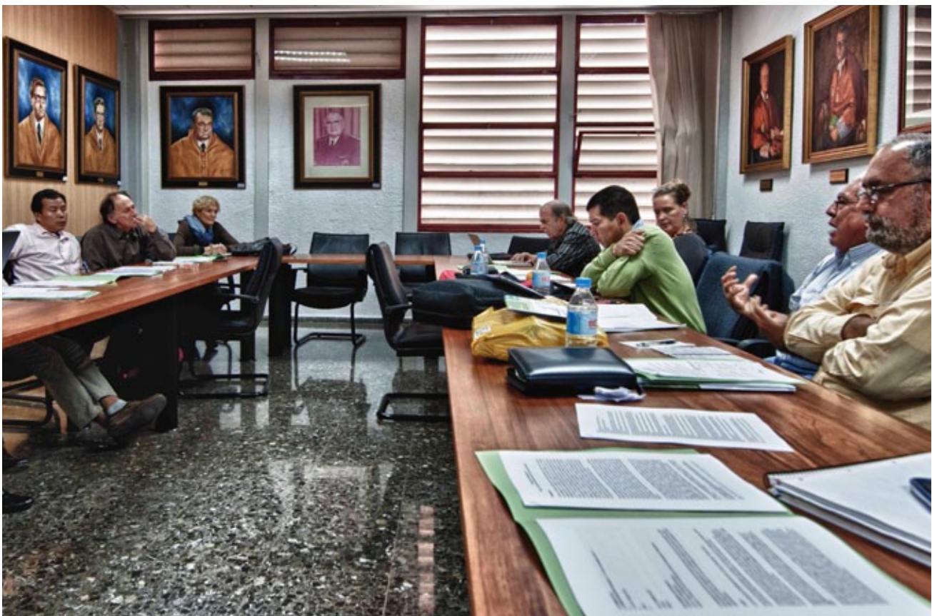
Valencia meeting at the Valencia Polytechnic University, experts from Peru, Colombia and Myanmar discuss Alternative Development

The UNGASS on the World Drug Problem was held in New York between April 19 and 21, 2016. This Special Session was originally planned for 2019, ten years after the 2009 High Level Segment in Vienna, but three Presidents (of Colombia, Mexico and Guatemala) called upon the world community to urgently discuss all possible scenarios, since current drug control strategies are failing to address the increasing violence related to drug markets in their countries. These countries argue that alternative policies should be discussed openly, with a focus on health, human rights,