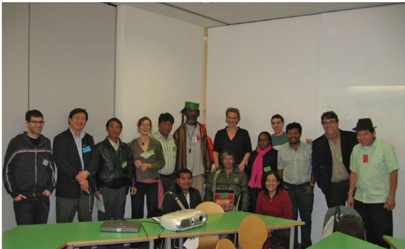
Working Group at 2009 Barcelona Forum

Preparations for the First Global Forum began in 2007 and, after one and a half years, the Valencia-based NGO CERAI, with several other organisations, was able to host this historic gathering.