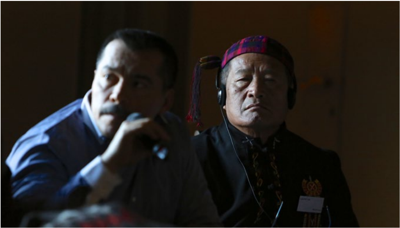
Delegates from Mexico and Myanmar participating in one of the working groups in Heemskerk

the conflict in our area is not so much existent because of business interests, but more because of political interests. We have many ethnic groups, but after the period of British colonisation, many of those groups are again fighting for political power. These conflicts often are fought in the mountainous zones. To fight a war you need an army, to have an army you need money. To find money in the mountains, you will need to find opium. It's a high value cash crop."