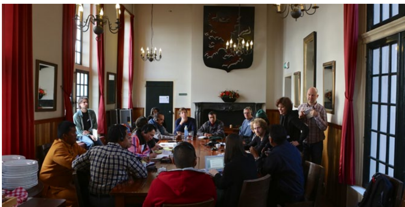
Delegates sharing their experiences in a working group

After the approval of the Heemskerk Declaration, all delegates were asked to elect one representative for the plant they grow to travel to New York and attend the UNGASS.