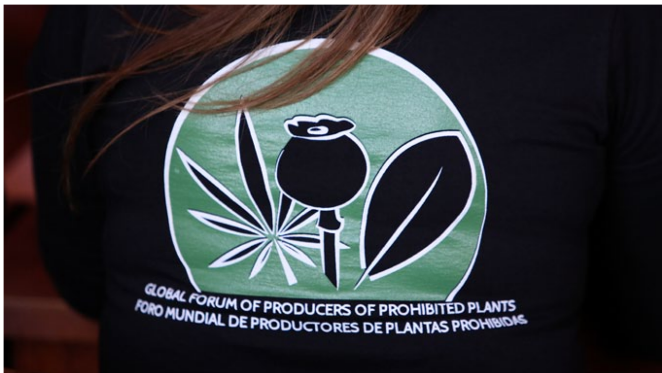
The T-shirt of one of the volunteers

“We have been advocating reforms from the government to the king. We are coming with