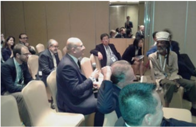
The TNI side event at the ICAD2 on meaningful farmer's participation