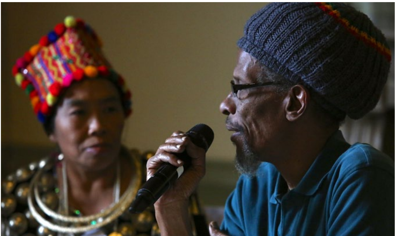
Representative of Jamaican Farmers speaking at the Growers Forum 2016

Illicit 2 , which took place in January 2009 in Barcelona. The Forum was attended by more than 70 leaders and representatives of farmers involved in the cultivation of cannabis, coca and opium poppy in Asia, Africa and Latin America & the Caribbean. More than 30 international experts, NGOs and government representatives also attended the meeting.