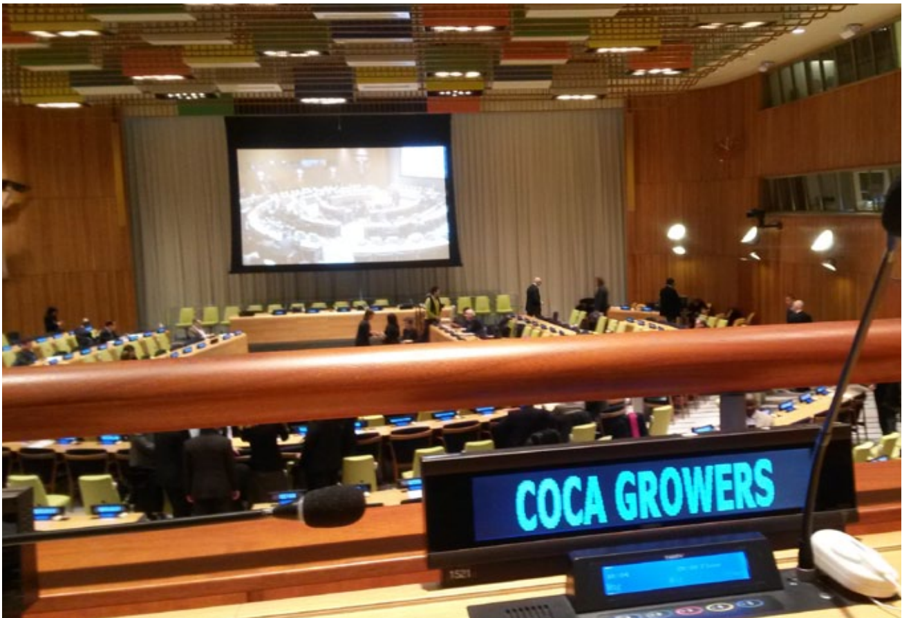
Coca growers represented at the UN Headquarters in New York

March 2016 in Vienna, during the two-day UNGASS preparation segment. CSTF members also presented the conclusions of their consultations with regional representatives and affected populations.