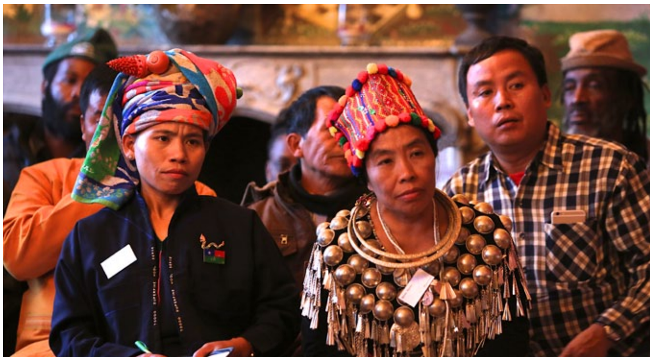
Members of the Myanmar delegation

The international drug conventions limit the use of opium poppy, coca and cannabis to exclusively scientific and medicinal purposes. The existing traditional uses of these plants are not recognised in the global drug control regime, although this exclusion has been challenged from the moment these conventions were negotiated. This omission has led to further polarisation of the debates about the validity of these legal instruments. Only very