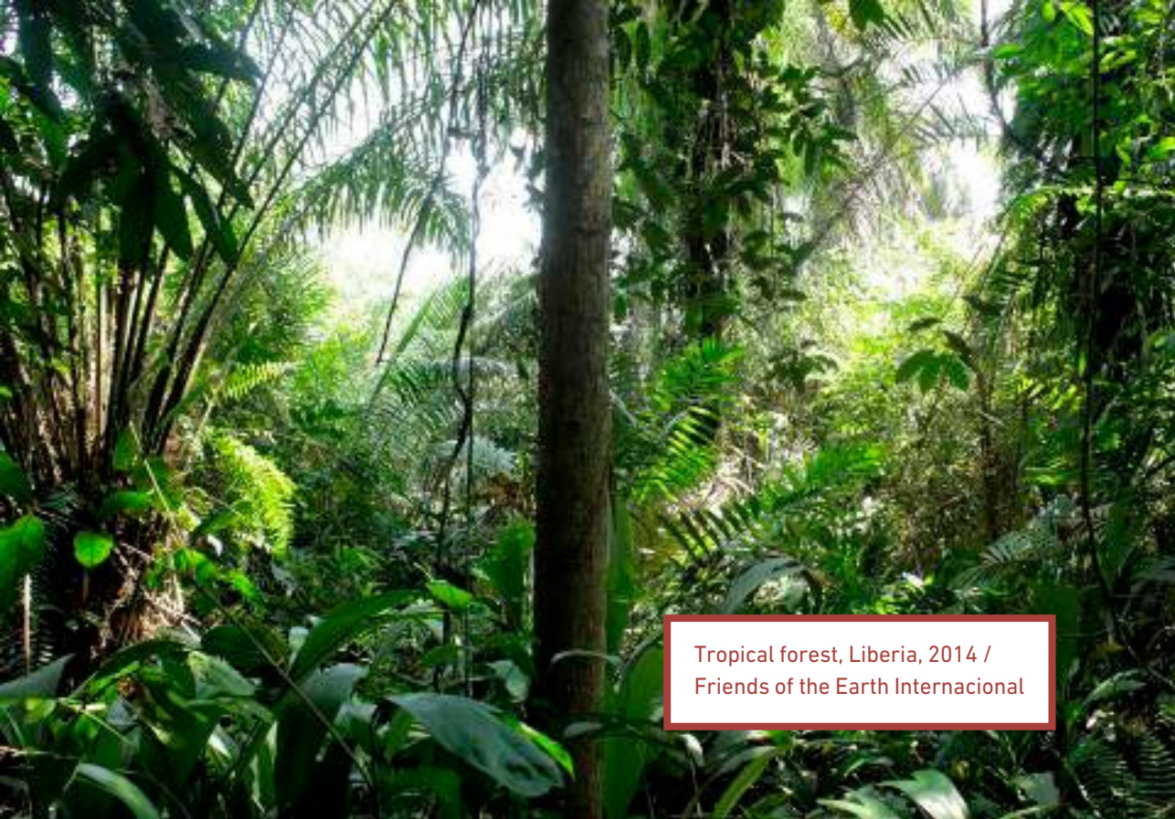
Tropical forest, Liberia, 2014