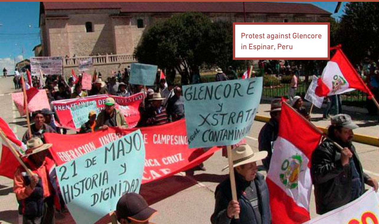
Protest against Glencore in Espinar, Peru

In Peru, Glencore's operations have also generated a substantial number of labour disputes and in several cases, the corporation has attempted to block trade union organising. In 2008, while the process to create a new national metalworkers union, SINTRAMIN (Sindicato Nacional de Trabajadores Metalúrgicos), was underway at the Rosaura mine, of which Glencore owns 85%, Glencore subsidiary Perubar suddenly announced the mine's closure and the firing of 500 workers. It claimed that this was because of losses it incurred from the decline in international prices. The mine was sold to Los Quenuales, another company controlled by Glencore. In spite of these circumstances, workers succeeded in founding SINTRAMIN, through which they filed a suit against the corporation at Peru's Labour Tribunal and Supreme Court. They are also considering the possibility of taking their case to the Inter-American Court of Human Rights. Here is another example: in December 2013, 35 workers of the Tintaya Antapaccay mine were fired. They all belonged to a newly formed trade union. The corporation's lawyer proposed their return to work, but on the condition that they renounce their union membership. In February 2014, a Peruvian Ministry of Labour inspector confirmed that through its hostile actions in this case, the corporation had violated trade union rights. 28