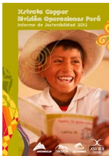
Front cover of Glencore's 2012 Sustainability Report in Peru

Glencore earns more than 70% of its profits from the extraction, processing and commercialisation of minerals and metals (copper, zinc, nickel, aluminium, iron ore, gold, silver, cobalt, ferrochrome, platinum, palladium, rhodium and vanadium). Among the minerals and metals that generate major profits for Glencore, copper and zinc stand out in particular, as sales reached 25 billion dollars in 2014. On the global level, the corporation claims that it is, in fact, the number one supplier and third largest producer of copper. That same year, it sold 2.8 million tonnes and produced 1.5 million. 11 Practically one third of the money obtained from this metal came from South America (Chile, Peru and Argentina) and 20% from African mines located in the Democratic Republic of Congo (Katanga, Mutanda) and Zambia (Mopani). Its zinc production (1.38 million tonnes) enabled it to make another 7 billion dollars in sales and represented, in terms of volume, 10% of the world's zinc production. 12