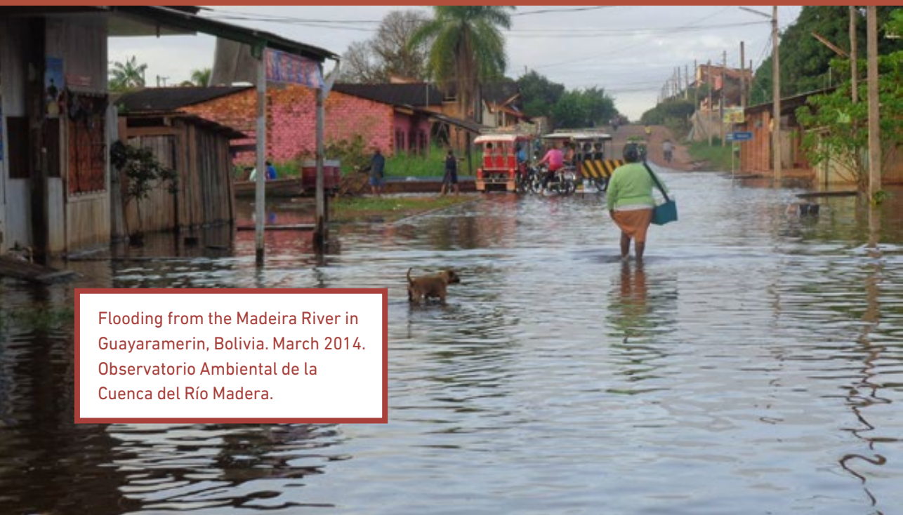
Flooding from the Madeira River in Guayaramerin, Bolivia. March 2014.