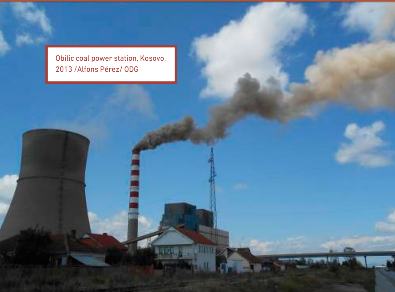
Obilic coal power station, Kosovo, 2013

Furthermore, the fact that each carbon credit is accepted as a 'reduction' of the equivalent of one tonne of CO 2 is based on a decision made by governments and corporate groups. However, there is no real way to verify if one tonne has been in fact 'reduced'. Even worse, as the carbon market is based on a range of assumptions attempting to 'equalize' different types of gases, time frameworks, technologies, places, among many other things, in practice, conducting any real 'verification' process is unfeasible. The same logic is followed for biodiversity 'offsets'.