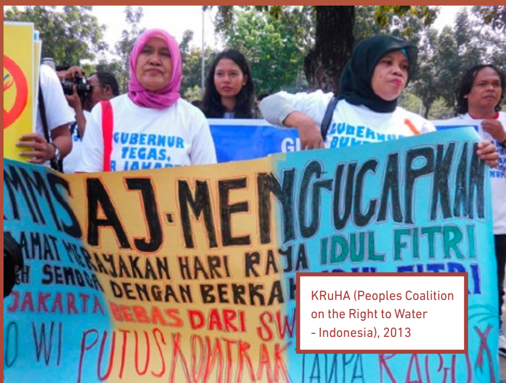
KRuHA (Peoples Coalition on the Right to Water - Indonesia), 2013