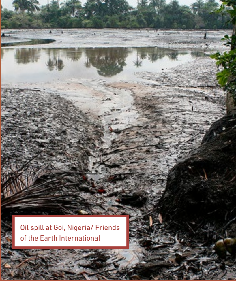
Oil spill at Goi, Nigeria