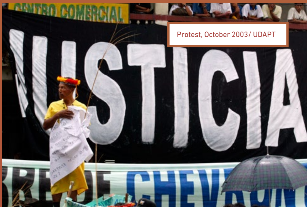
Protest, October 2003/ UDAPT