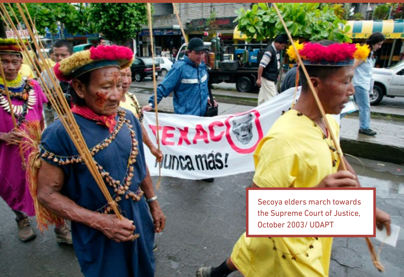
Secoya elders march towards the Supreme Court of Justice, October 2003