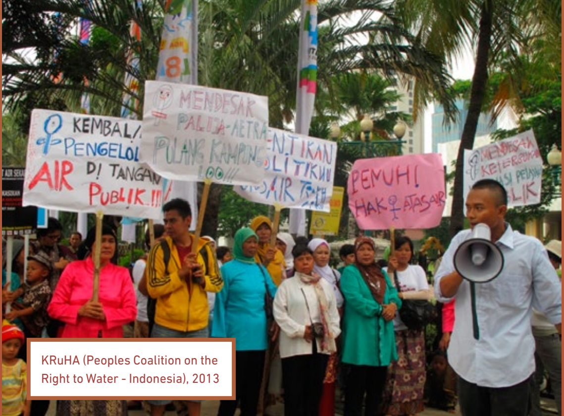
KRuHA (Peoples Coalition on the Right to Water - Indonesia), 2013