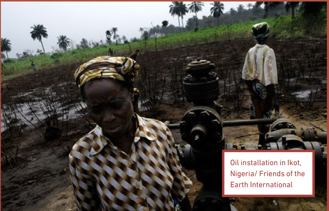
Oil installation in Ikot, Nigeria/ Friends of the Earth International