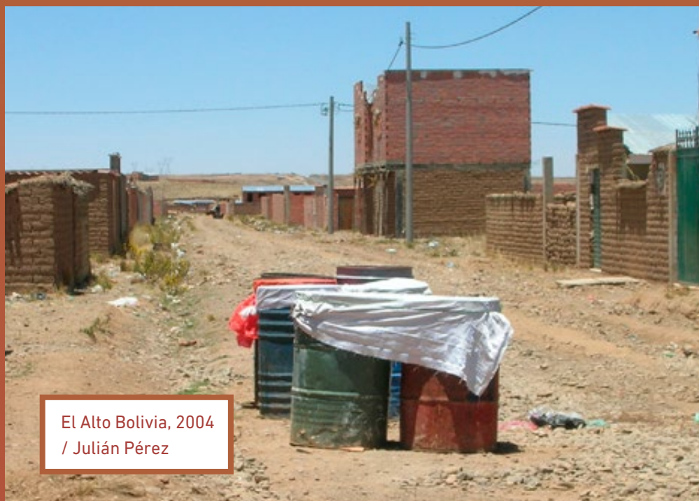
El Alto Bolivia, 2004