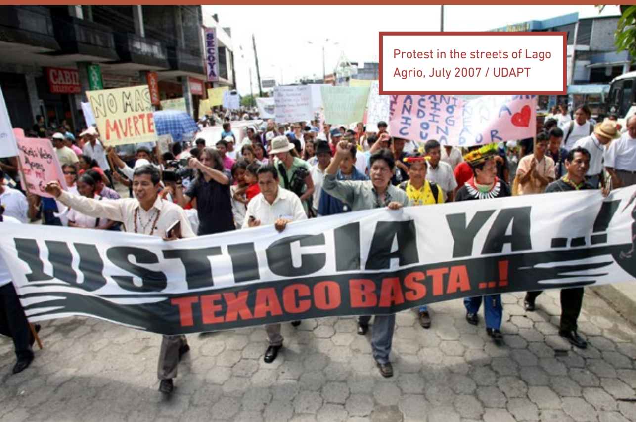
Protest in the streets of Lago Agrio, July 2007

After 21 years of court battles, Chevron continues to act with impunity, while the victims of its activities in Ecuador continue to wait for justice and compensation. The important work carried out by the Unión de Afectados por las Operaciones de Texaco en el Ecuador coalition includes preparing the 30,000 affected men and women to collectively manage in the near future the compensation that is legally and ethically due to them.