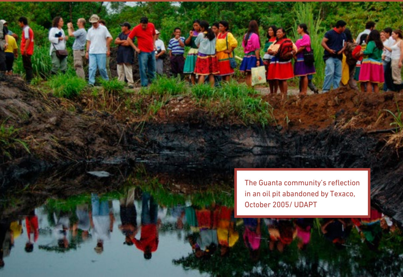
The Guanta community's reflection in an oil pit abandoned by Texaco, October 2005

In 26 years of exploiting oil in the Ecuadorian amazon, Chevron (previously Texaco) polluted more than 480,000 hectares in one of the most biodiverse areas of the world, destroyed the living conditions and livelihoods of the region’s inhabitants, and caused the death of hundreds of people and a sudden increase in the incidence of cancer and other serious health problems. It has been calculated that more than 60.6 billion litres of toxic water were poured into the rivers, 880 pits for dumping hydrocarbon waste were dug and more than 6.7 billion cubic meters of natural gas were burned. 20