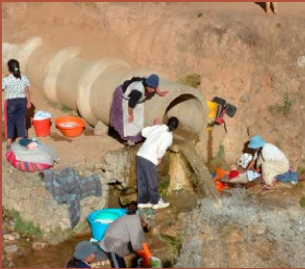
El Alto Bolivia, 2004