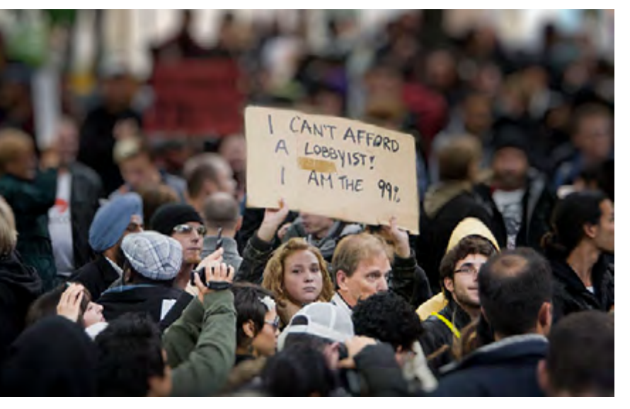
experience in mind (e.g. Canada-US and EU-US cooperation efforts), this lack of clarity creates a real risk of lower social, environmental, and consumer standards and an undermining of democratic principles by strengthening the role of business lobbyists in the development of legislation. To enshrine regulatory cooperation in a trade agreement between the EU and Canada would permanently weaken the role of parliament and the public sector in setting regulation.