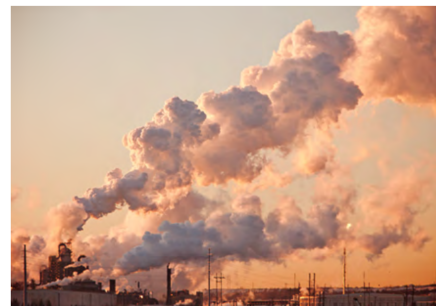
Photo: kris krüg, For McMurray, Alberta – Operation Arctic Shadow flickr, CC BY-NC-ND 2.0, https://bit.ly/1TJsE5c

These extensive protections offered to investors in CETA, together with the agreement's strong emphasis on the lib- The international community has comeralisation of services and procurement, compromise two central aspects of sustainable energy and climate policy: the push to restrict and rapidly phase-out fossil fuel-based energy, and efforts to promote and develop alternative renewable energy sources.