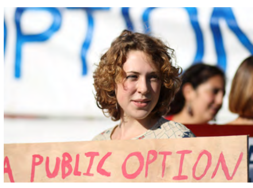
Photo: Sage Ross, Health care reform supporter 2 at town hall meeting in West Hartford Wikimedia Commons, CC BY-SA 3.0, https://bit.lv/20VD4nh

CETA is the most wide-ranging agreement ever concluded by the EU in the area of services and investment. CETA offers Canadian and European service providers extensive additional opportunities in terms of market access, the protection of their investments and the enforceability of their commercial rights. In CETA, public services are affected by obligations and commitments in the chapters on investment, cross-border trade in services, and government procurement, as well as by cross-cutting rules on market access, non-discrimination (national treatment. most-favoured-nation treatment) and investment protection (notably the controversial and highly problematic 'fair and equitable treatment' and indirect expropriation clauses).