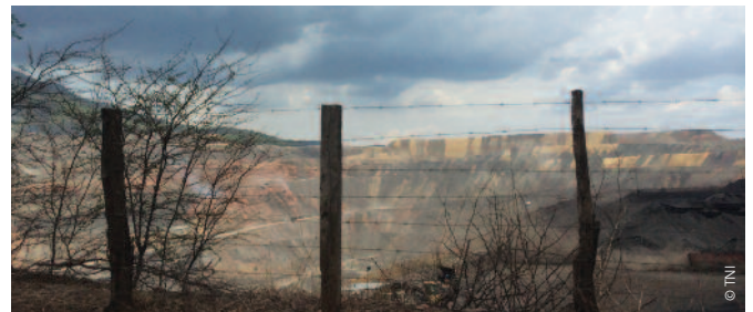
The territories of indigenous, Afro-Colombian and peasant communities have been privatized through its control, pollution and appropriation.

Operations at the El Cerrejón open-pit coal mine, located in La Guajira on Colombia's Caribbean coast, began more than 30 years ago. In 2000 the Colombian government sold its shares to three transnational corporations: BHP Billiton, Glencore Xstrata, and Anglo American. Despite the massive social and environmental conflicts of the mine, it is a member of the UN Global Compact and its motto is "responsible mining". 7