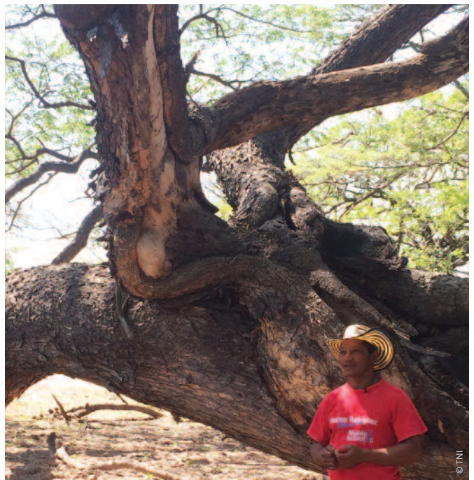
Holy tree, previously used for its medicinal properties to treat diseases and as a meeting point for the community, its big shade used to protect a lake.

Despite the harsh conditions, the diverse local populations of La Guajira are working together to expose the truth about mining in Colombia. Popular environmental education programmes build locally held knowledge that can counter the years of government and corporate misinformation. Days of action have also brought together numerous organisations and communities from La Guajira, the rest of Colombia and also internationally. Actions include holding popular tribunals against mining, visits to sacred sites, and autonomous public hearings held to define the future of the territory. 21 Today, they also work to denounce and to give greater visibility to the situation through the La Guajira le habla al país website www.extractivismoencolombia.org . 22