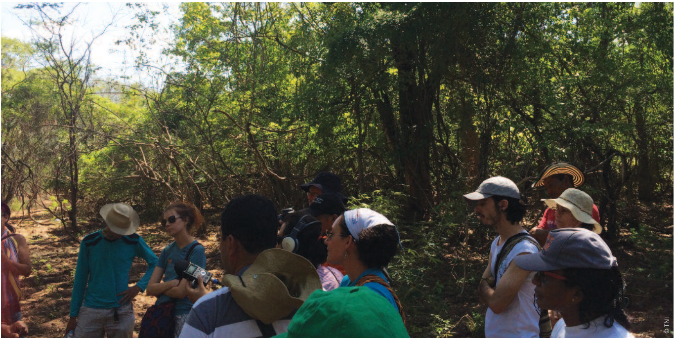
Representatives from national and international organizations visiting sacred places during the popular tribunal against mega mining, 2010.

At COP20 in Lima the foundations will be laid for the pivotal climate summit in Paris at the end of 2015. With climate change already a reality, the stakes are simply too high to allow corporations like Anglo American to shape the agenda. Around the world, people and movements are already proving that real solutions for social, environmental and climate justice can and do work. It's time that decision makers started paying attention to them instead.