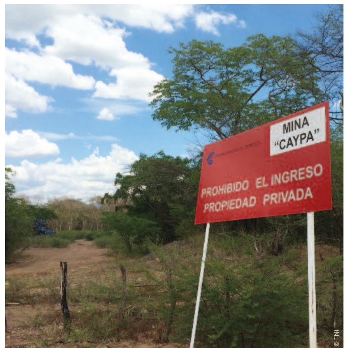
A sign blocking the entrance to part of the mine.

The financialisation of nature means common resources are transferred into the hands of corporations and the financial system, concentrating power over them further, while communities lose sovereignty and their rights to use and live in their own territories. 6