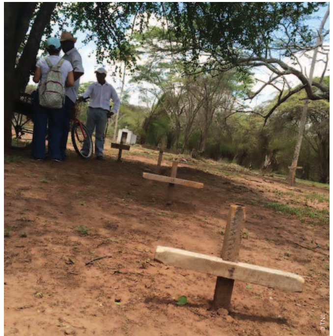
A cemetery in the Roche Community territory.